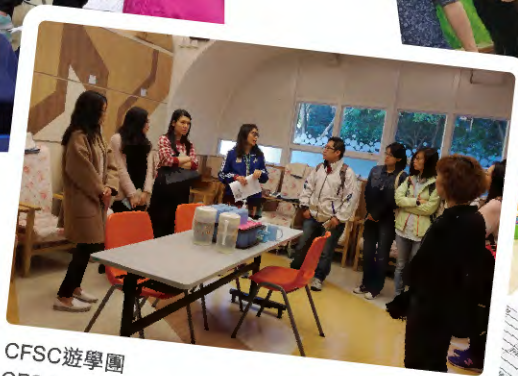
CFSC 遊學團 CFSC Visit Tour