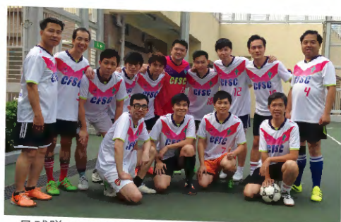
足球隊 CFSC Soccer Team