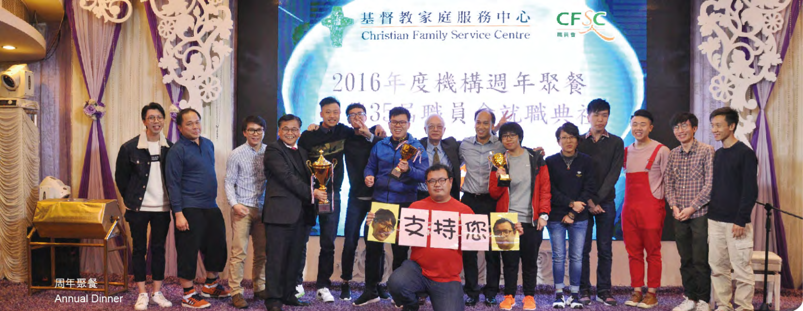
周年聚餐 Annual Dinner