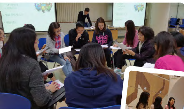
舉辦不同類型的講座及工作坊 Organised different talks and workshops for our staff.

本會亦關顧將計劃退休同工的身心靈發展及退休前的預備，每年都安排「不退休：精彩的人生下半場」講座。此外，培訓組每年也會組織交流活動「CFSC 遊學團」，以加深同工對機構及服務單位的認識，增加歸屬感之餘也可促進服務單位的協作機會。總結 2016-2017 年度，本會共有 1,243 人次參與各類型的培訓活動。