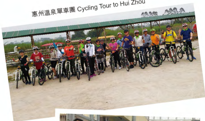
惠州溫泉單車團 Cycling Tour to Hui Zhou

To acknowledge the commitment and diligence of our staff, a 'Long Service Award' would be presented yearly at the Annual General Meeting to pay tribute for their contribution to the Agency. Of the total 54 staff receiving the award, 20 of them were granted the award for 10-year service, 16 for 15-year, 7 for 20-year, 9 for 25-year and 2 for 30-year.