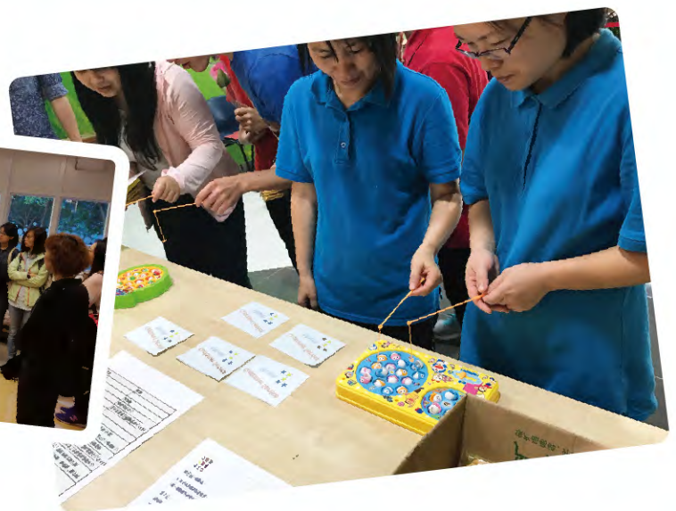
午間資訊站 Lunchtime Information Station

To cater for the physical and spiritual well-being of retired workers and their preparation for retirement, the Agency conducts retirement talk 'No End: A wonderful second half of life' every year for staff to have a better retirement preliminary. Moreover, our Training Unit organises CFSC visit tour to our service units annually to promote awareness, increase sense of belonging, and facilitate collaboration between service units. In summary, a total of 1,243 attendances have participated in various training activities in the year of 2016-2017.